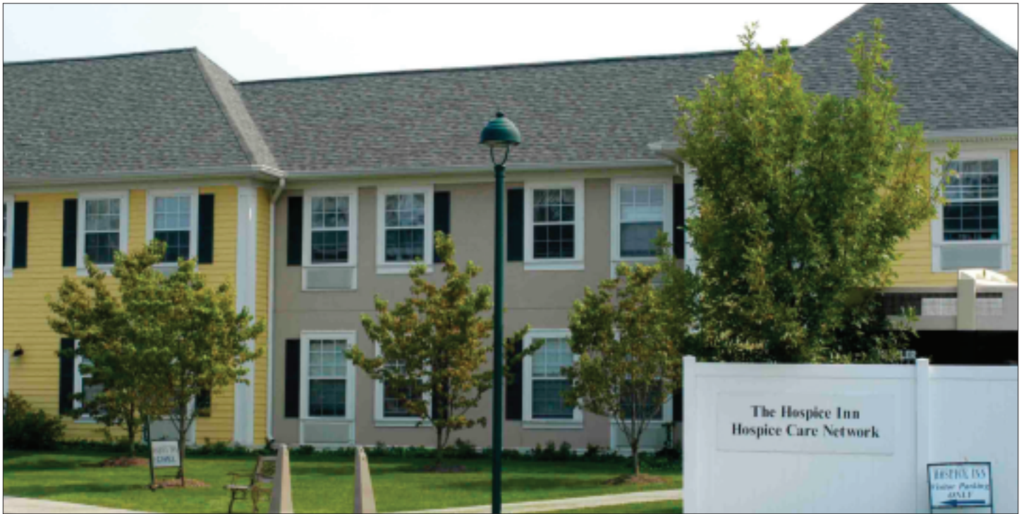
Hospice Inn at Huntington in New York.